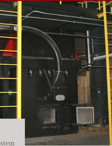
Owner: Bennington College Location: Bennington, Vermont Project: Renewable Energy Biomass System